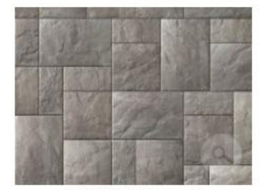
NEW YORK BLEND